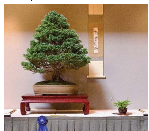
This beautiful Award of Merit Boulevard Cypress was only one of several trees shown by Victor Zurczak.